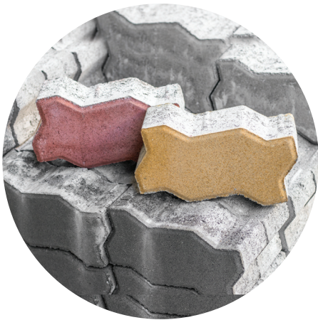
Zig Zag Pavers